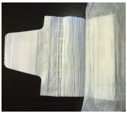
SOLUTION 2 Zero Waste solution